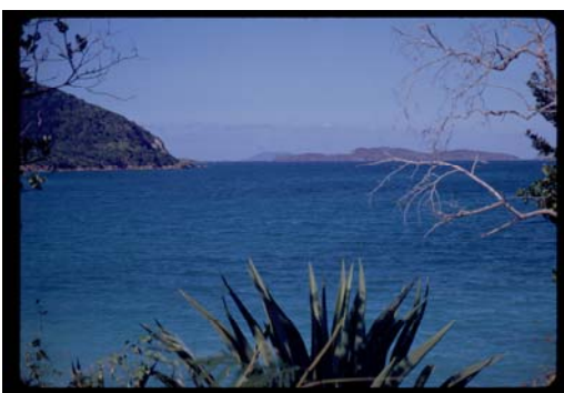
Red Hook is to the left