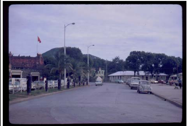
Bluebeard's Castle and Views of Charlotte Amalie Harbor