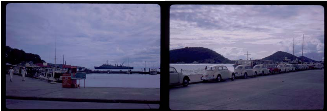
VW Beetle rental cars were available for $5 per day. Cruise ships have replaced Navy ships.