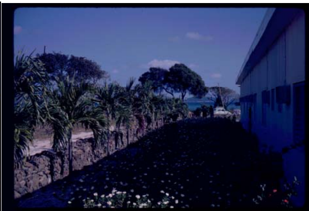
Vessup Bay is in background