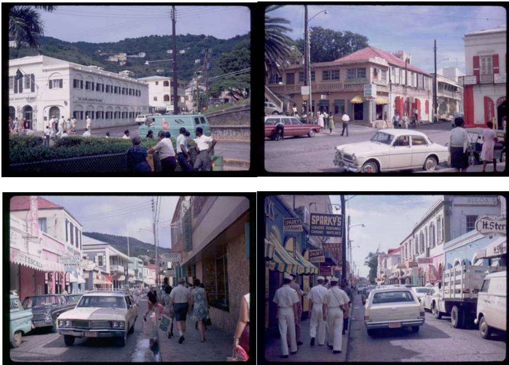
Sailors have been replaced by cruise ship passengers.