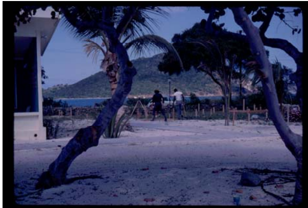
Vessup Bay is in background of picture on right.