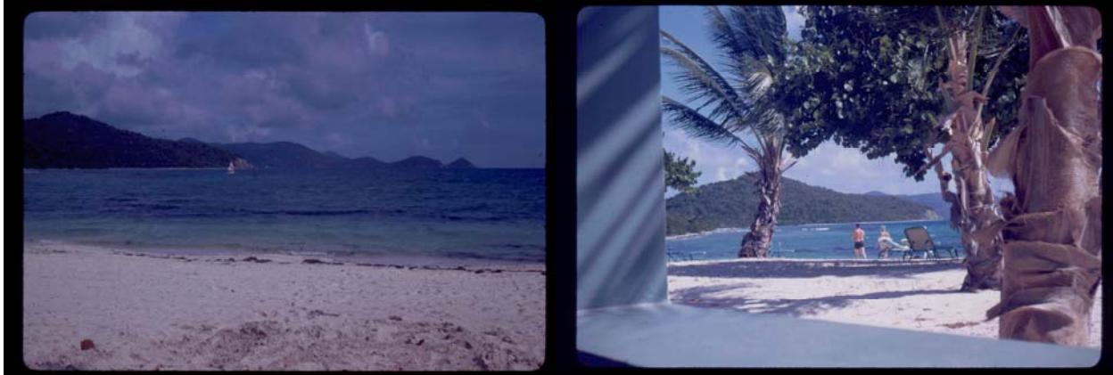
Cabrita Point on left - St. John is in the background