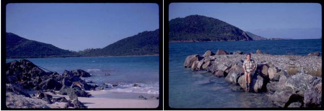
Entrance to Vessup Bay and Red Hook Marina