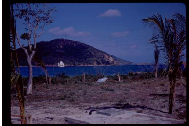
Vessup Bay - Red Hook to left