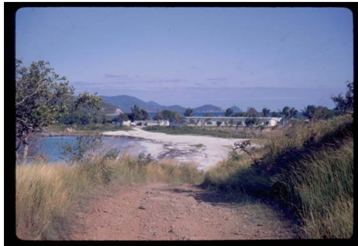
Rear of Bluebeards Beach Hotel with St. John in distance and Vessup Bay on left